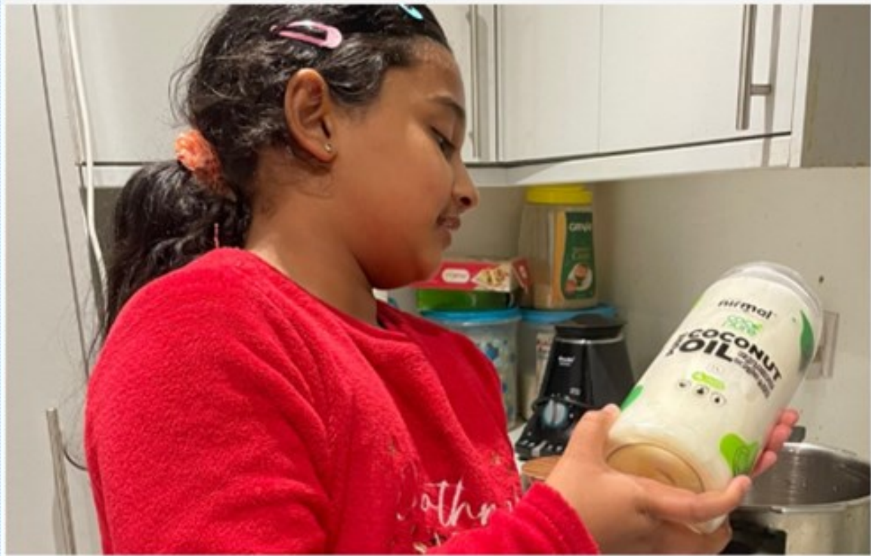
Above: Abigail of 4U demonstrates how her family uses coconut oil instead of palm oil.